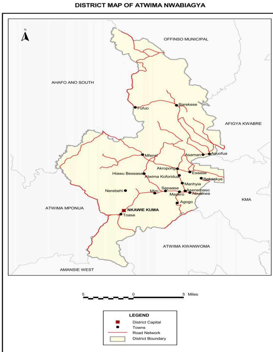
Figure 1. District Map of Atwima Nwabiagya

The district map is shown in Figure 1 below. 4