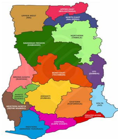
Figure 1. Map of Ghana

Figure 1 below is the map of Ghana with regions and capital towns of the regions.