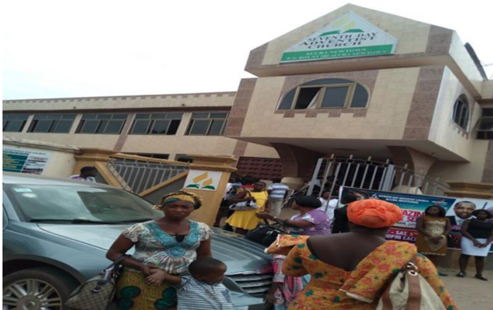
Figure 3. Accra Newtown Current place of Worship

Eleven leaders were selected for the interview with judgmental sampling technique in the selection of participants. Majority of the overall interview were conducted on one-on-one basis, with the writings as records for the research. Three days were selected for the interviews, September 30, 2020, October 1, 2020; October 2, 2020. The information ascertained from the interviews were very good materials which sought to provide good basis for the inability to get to the grounds for evangelistic activities and the strategies to enhance framework for church planting for implementation and policy formulation in the Accra New Town District of Seventh-day Adventist Church. Most of the information got through were problem-solving issues which provided answers for the existing issues being discussed. The total membership as of October 2020 as found in Table 3 below is two thousand two hundred and sixty-two (2262) members.